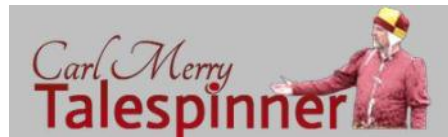
(click the image above).